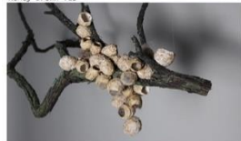
Asha Bore Y12