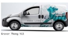
Grover Thang Y13