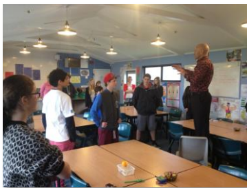
Steve Gurney at work in the Pavilion

Earlier this term, 25 of our top Physical Education students had a visit from one of NZ's greatest multi sport athletes, Steve Gurney. Steve was a professional multisport athlete most known for winning the Coast to Coast race a record 9 times. During his interactive workshop, Steve shared his strategies for success, the use of neuro linguistic programming (the study of success and excellence), and discussed the importance of innovation in training and sport.