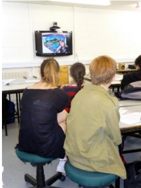
Year 10 Kelly Students