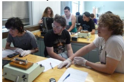
Physics students hard at work

Year 12 and 13 Physics students had a rare opportunity to measure the radioactive decay of Barium at Victoria University. They were tutored by four PhD students who were themselves graduates of WHS. Physics students from recent years at WHS are working on making the chips to drive Quantum Computers and are at the cutting edge of scientific knowledge with lasers and nanotechnology. Big thanks to VUW and the students for maintaining the strong links between the High School and the University and inspiring our students to be the best in science.