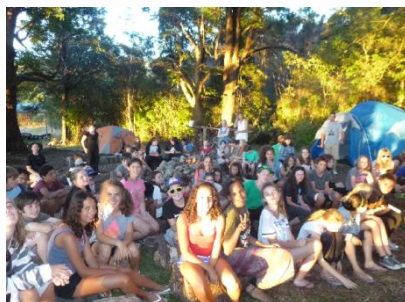
Kelly students at camp

2013 has seen the arrival of a group of 180 Year 9 students at WHS – what a great group of youngsters we have had joining our school. The start of the year has been productive with students beginning a variety of rotations alongside becoming settled in their Tukutahi groups. The first of the group, Kelly, went away on camp in week 5. The weather was very kind and students enjoyed various activities that were organised by staff at Camp Kaitoke. They also had the opportunity to spend a night in tents and cook some damper over an open fire. We are looking forward to the next camps in week 7 and week 11.