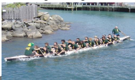
Impressive action by WHS students

The WHS student dragon boating team has been training for three weeks and they are looking pretty good out there in the harbour. So make sure you come along and support our students on Sunday 17 March at FrankKitts Park . The staff team will take to the water on Saturday, 16 March.