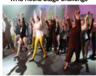
125 students from Wellington High participated in the regional Stage

Challenge competition on Friday 31 May. The concept of our performance was to bring attention to the on-going impact of deforestation. Our students worked for months to create and perfect their performance and we are very proud of their efforts and their superb participation on the day. One the night we were awarded the Ministry of Youth Development Student Lead Award, Award of Excellence for Set, Design and Function, Award of Excellence for Choreography, and the Lion Foundation Award of excellence for Costuming Character. Well done to everyone involved.