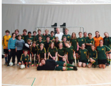
WHS Futsal teams at CSW Regionals

WHS has competed in all levels of futsal in term one with some outstanding results. We have been represented in the weekly College Sport Wellington intercollege competition, in CSW Regionals and in the Nationals. CSW Intercollege Competition – 4 GOLDS won by Girls Senior A & B, Girls Junior A and Boys Junior B CSW Regionals – 2 GOLDS won by the Boys and Girls Senior A teams Nationals – Senior Girls Runners up, Senior Boys 4 th