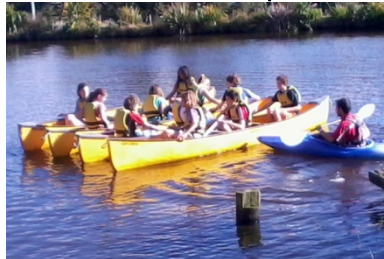
Noall on the water at Kaitoke

Week 11 saw the last Year 9 camp for this year. While Noall didn't have the splendid weather that earlier camps enjoyed, all the students and teachers participated in a variety of activities and made new connections with each other. Many of the Year 9 students have already gained their school "citizenship" and it is hoped that the remainder will do so early next term.