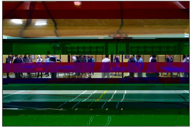
Table tennis in the gym

Junior and senior girls and boys ladders are being setup with challenge games to be played on demand. In term 3 Wellington High will be competing in the Wellington Secondary Schools competition.