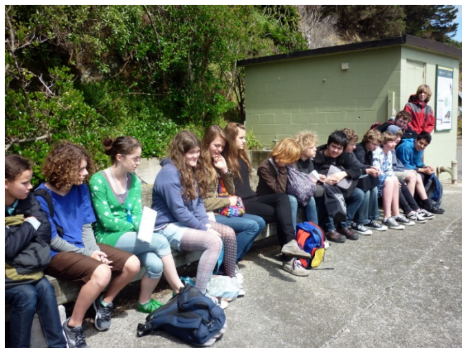
Year 9 Enrichment class on Matiu/Somes Island