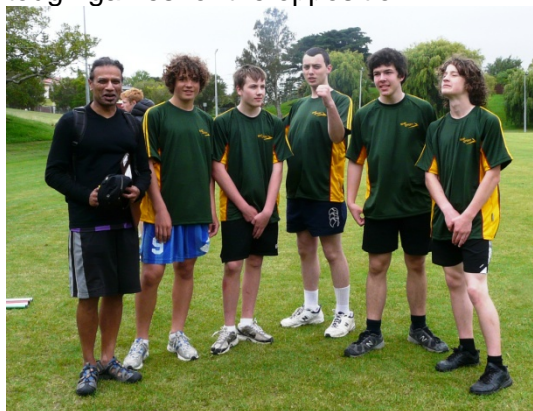
Boys' Athletics team