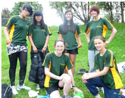
Girls' Athletics team