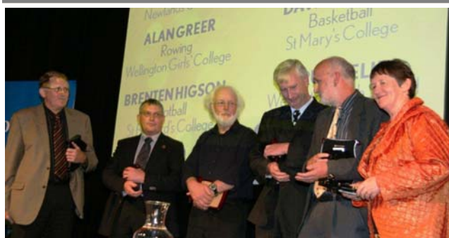
College Sport Wellington Sportsperson of the Year Awards 2011