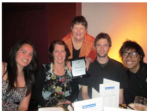
College Sport Wellington Sportsperson of the Year Awards