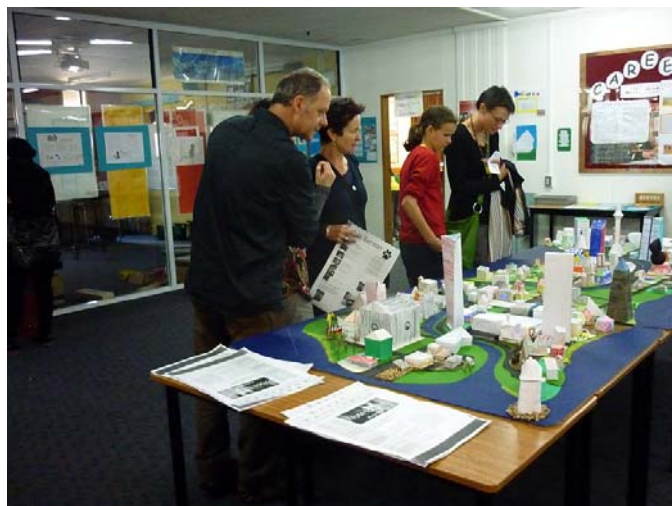
Parents and caregivers at the Yr 9 Exhibition

Parents and caregivers of Year 9 students joined us in an afternoon of viewing and experiencing their children's work from the last term. Welliwood, the miniature town created through the Mathematics faculty from hundreds of detailed and scale model buildings, was a highlight. Covering six tables with panels on walls and doors it showcased the detailed work of hundreds of students. Rileyville, Kelly Town and the Royal Chambers featured in the side rooms off the main Level three concourse. Parents agreed that it was a great showcase of student work from Term Four and all were intrigued by the tiny models, proud students and digital records.