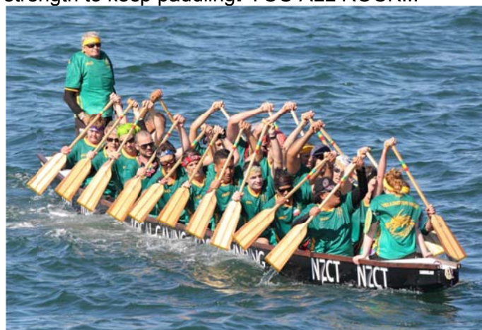
Staff Dragonboat team in action