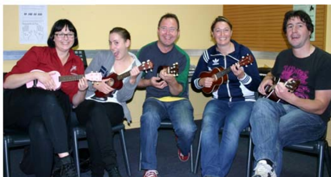
CEC Ukulele Class hard at work

These as well as over 600 courses are yet to start this year and can be viewed directly at www.cecwellington.ac.nz . Enrolment on-line is easy. Alternatively phone us for help. (Ph 385 8919).