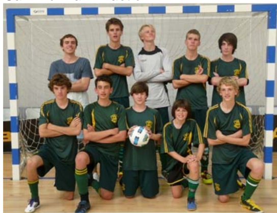
Wellington High Nationals Futsal Team