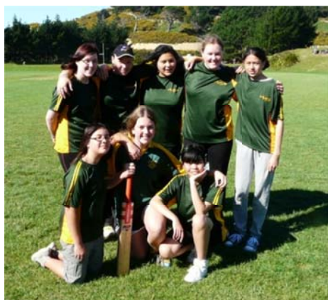
WHS Girls' Cricket Team 2012