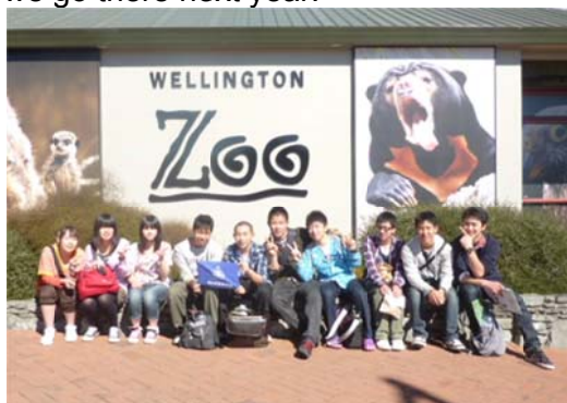
Kiryu Minami High School Students at the zoo

students and we hope to visit them in Japan when we go there next year.